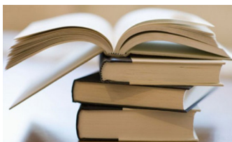
The Shin Buddhist Classical Tradition: A reader in Pure land teaching